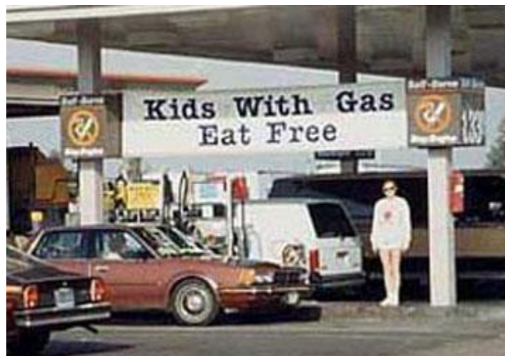
Load 'em up with burritos, Mom!!