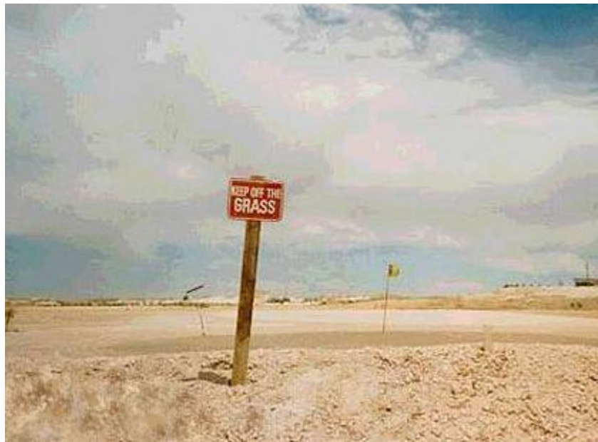
Beautiful, lush lawns of dirt...