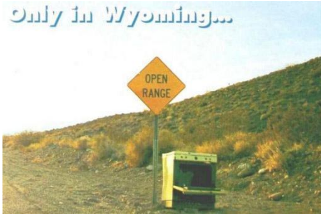
I can't even comment on this one