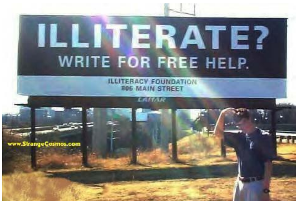
How can I write if I'm ILLITERATE!!!!