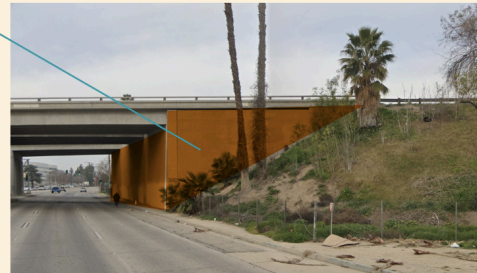
Q and 204 Team 2