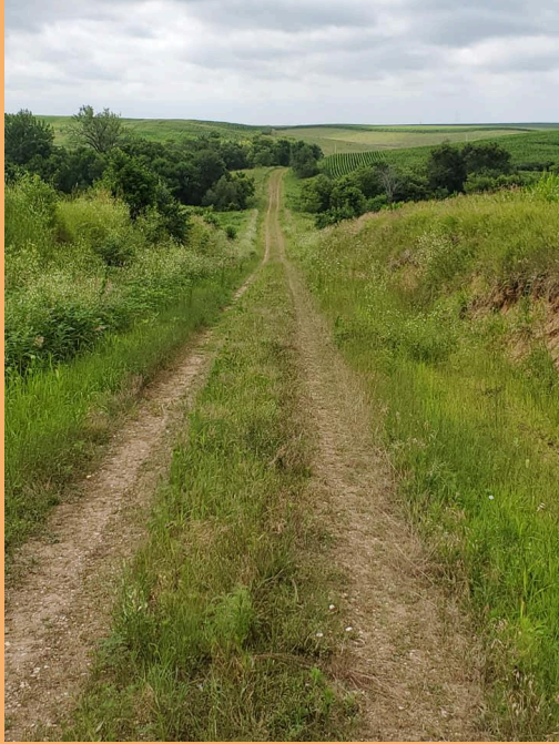
A Wolf Creek Cycling Company Production