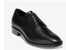
BLACK OXFORD STYLE DRESS SHOE