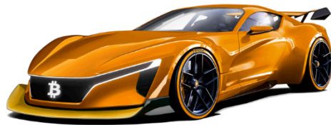
MODEL SATOSHI Limited Supply: 100