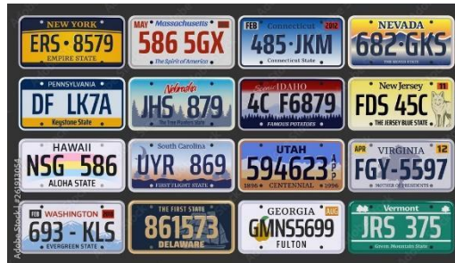
The big plates.