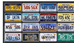
The small plates