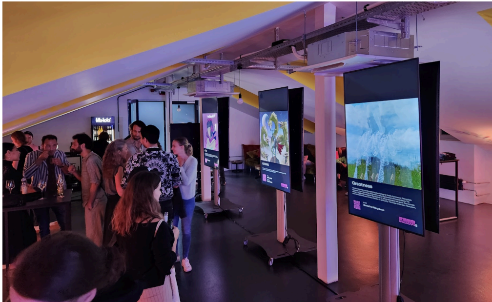
1. 2023 KODA On-chain Exhibition, Berlin