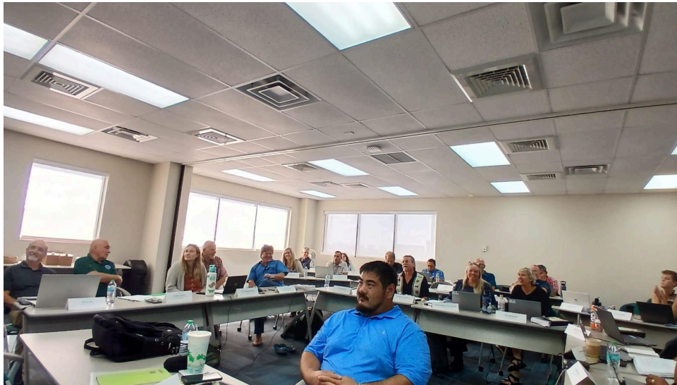
Wrapping up last items on the agenda.