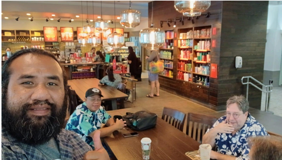
The RMI EPA and group held an early briefing on the first day of the UES Review Meeting.