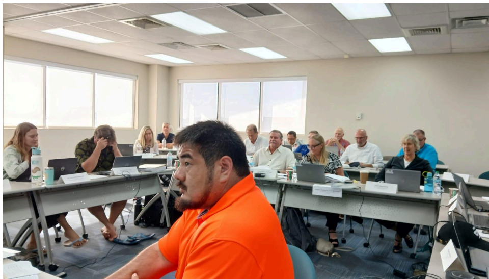
Halfway through the agenda on the first day.

HONOLULU - On Thursday, November 14, 2024, the UES (USAG-KA Environmental Standards) Review Meeting concluded. Between Tuesday, November 12th and Thursday, November 14th, the UES Appropriate Agencies adopted twenty-one (21) new modifications to the United States Army Garrison's Environmental Standards (UES) technical document. They withdrew/rejected four (4) proposed editions and deferred six (6) new editions to be ready by March 2025. The UES Appropriate Agencies consists of the US EPA (Environmental Protection Agency), RMI EPA, US FWS (Fish and Wildlife Service), US NMFS (National Marine Fisheries Service), and the US ACE (Army Corps of Engineers).