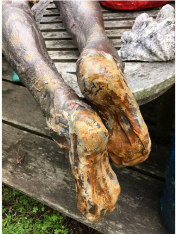
"80 and Still Dancing" , painted plaster (right: detail)