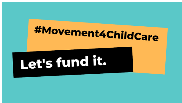
Shareable 1 Link