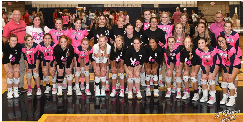
PHHS and PHN volleyball teams at Oct. 4 "pink" event

Our middle and high school athletic teams often hold "pink" events to support breast cancer research or individuals currently battling the disease. Recently, the PHN and PHHS Girls Volleyball teams held a pink event at their game on Oct. 4. They raised a total of $550.45 for Taking a Shot at Breast Cancer . Great job, ladies!