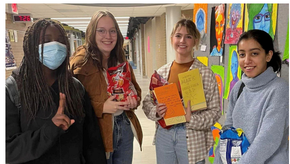
The PHN MAD Club distributing cards and treats