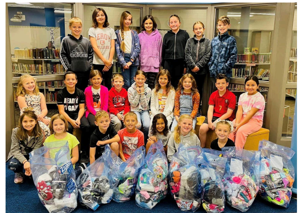
The Indian Woods Student Council displaying socks gathered during Sock-tober.

More photos of these events can be seen on the Indian Woods Facebook page and the Port Huron Northern Facebook page .