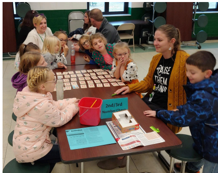
Garfield Elementary Family Math Night