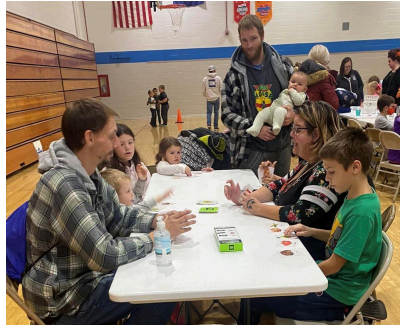
Crull Elementary Family Game Night

To see more photos from these events, please visit the Crull Elementary Facebook page and the Garfield Elementary Facebook page .