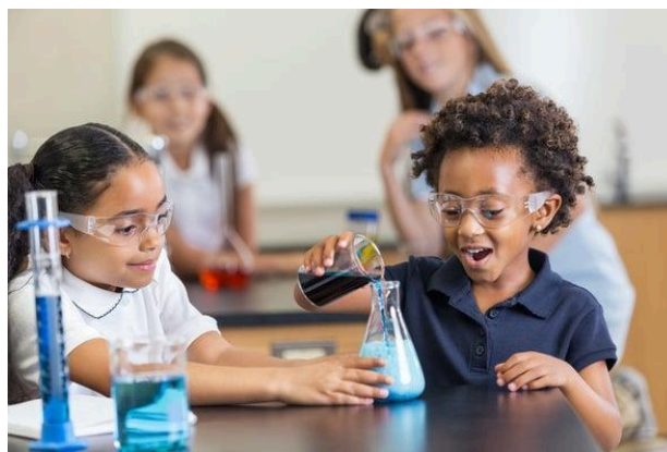
Figure 2. Attached figure in article

The figures must be arranged as example below: