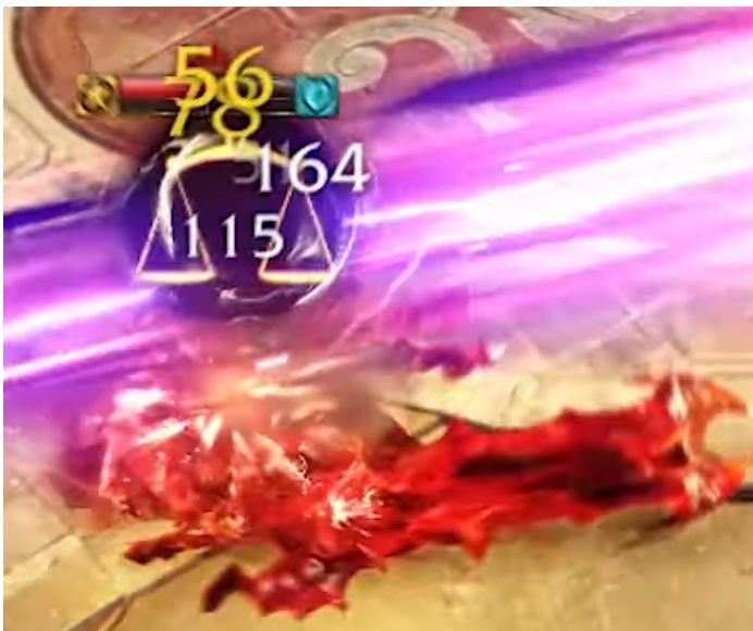
(Example of the Scale Symbol)

Stagger has Diminishing Return (DR). When a player gets staggered too much in a period of time, big scales will appear over the model and the character will be knocked down. The player with the scale symbol can not be staggered any longer. Some auto attacks of classes have stagger.