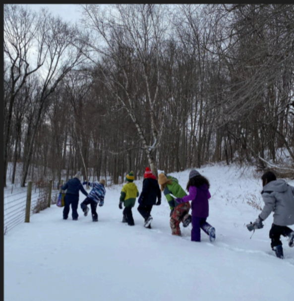
Last week, the 2nd and 4th Grade team went to Shelburne Farms to study animals in winter and tracking.