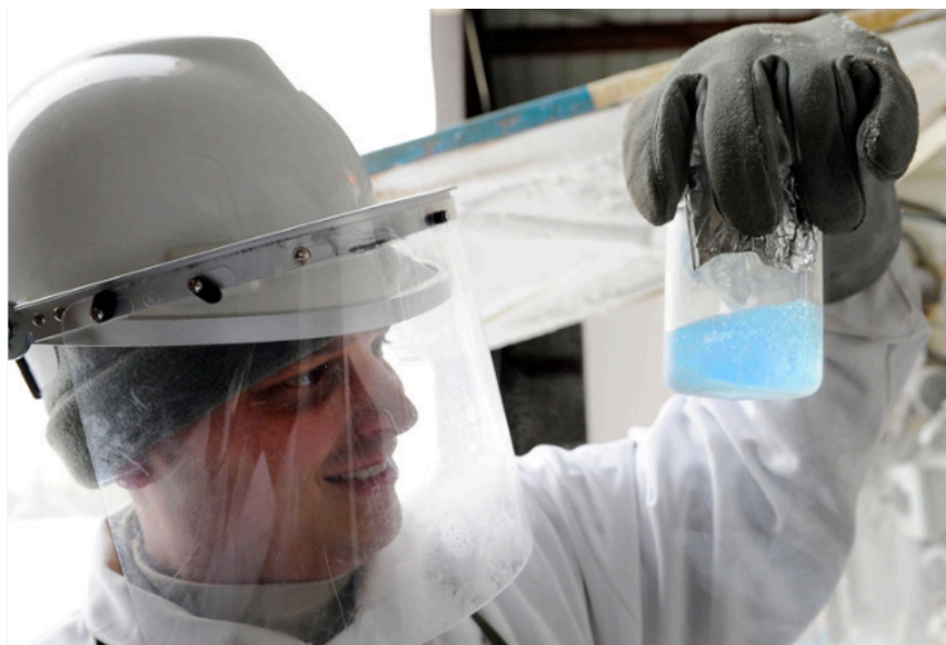
Oxygen is most commonly found in the gas phase, but scientists can make it change phase into a liquid.