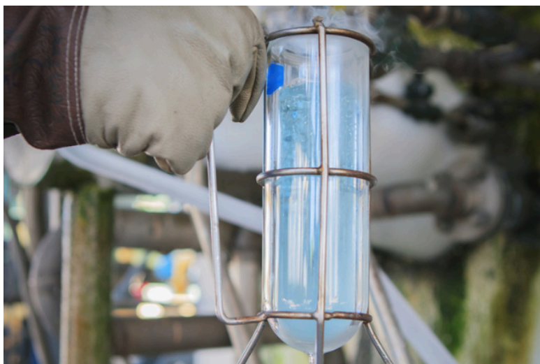
Oxygen is pale blue when it is condensed into a liquid.

In your daily life, oxygen is everywhere. It's in the air all around you, and even inside you, traveling from your lungs to every cell in your body. You probably think of oxygen as a gas, because that's how you encounter it—but it isn't always a gas. Oxygen can also exist as a liquid with a beautiful blue color. However, you'll never see puddles of liquid oxygen on the ground, and you can't buy a bottle of liquid oxygen at the store. Oxygen is very different from water, the most common liquid on Earth.