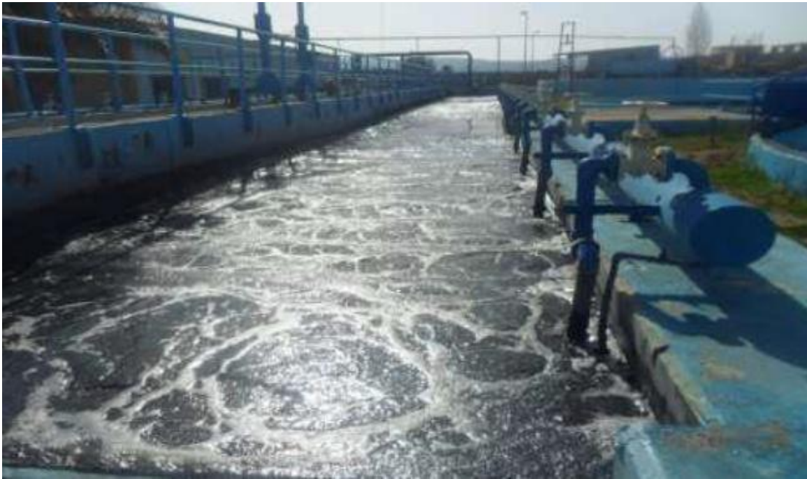
Figure 5. Biological basin (aeration basin).