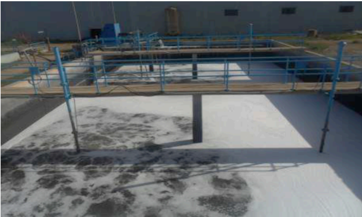
Figure 2. Photo of mixing and equalization basin N ° 1.

ullamcorper arcu eu orci finibus, vel feugiat tellus laoreet. Ut bibendum justo sit amet odio convallis, vel tincidunt enim maximus.