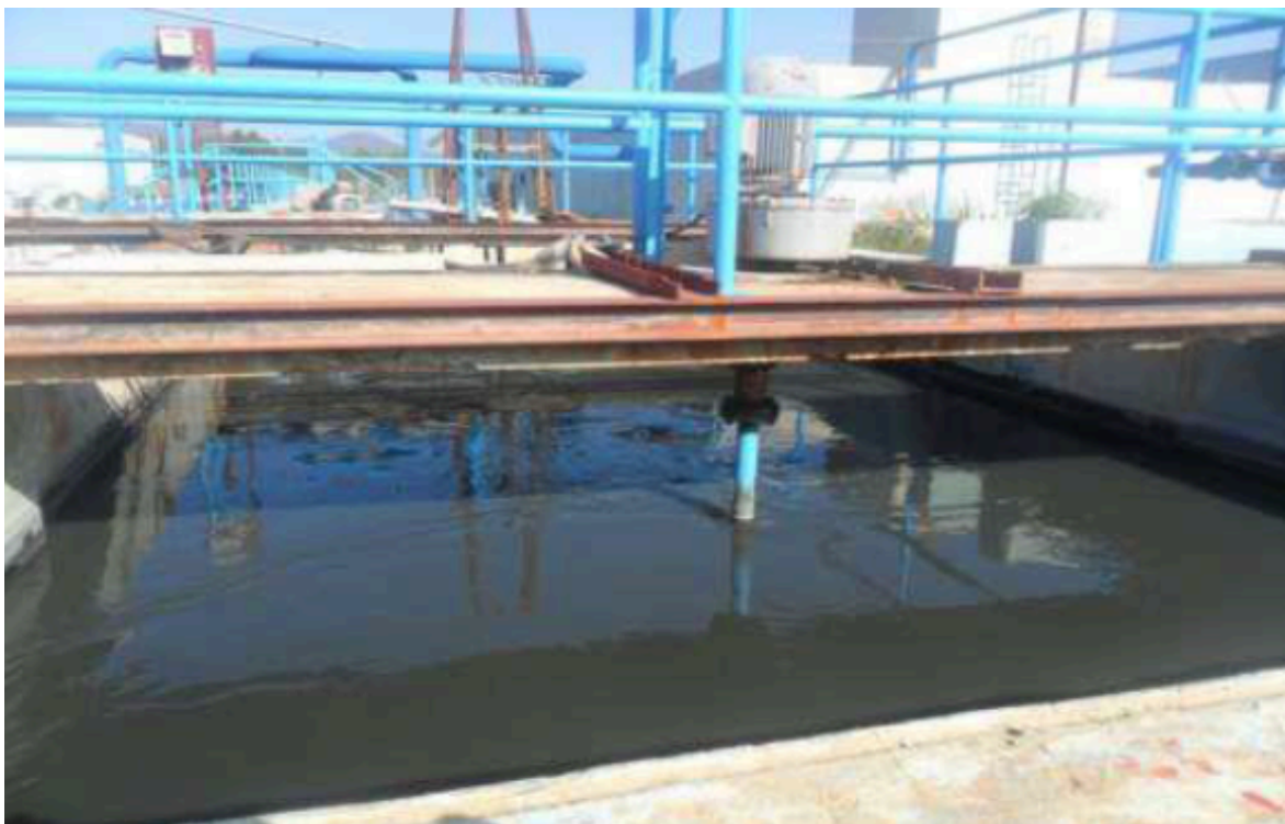
Figure 3. Mixing and neutralization basin N ° 2.