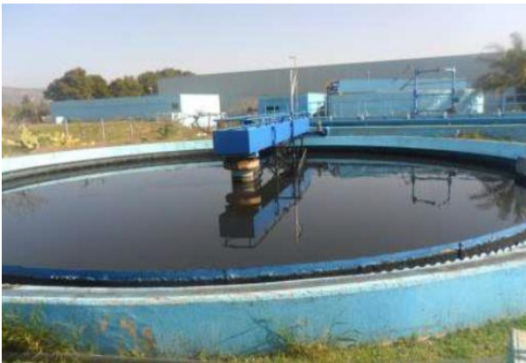
Figure 6a. Final clarification basin.