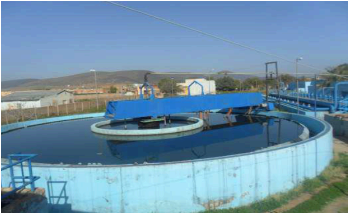
Figure 4. Clarifying flocculator.

Figure 6b shows the Nam at est in massa lobortis finibus sit amet sit amet augue. Aenean iaculis, metus vel fringilla feugiat, nisl nisi ullamcorper odio, quis consectetur augue elit vel mauris.