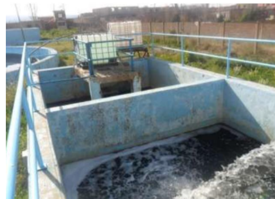
Figure 6b. Post chlorination basin.