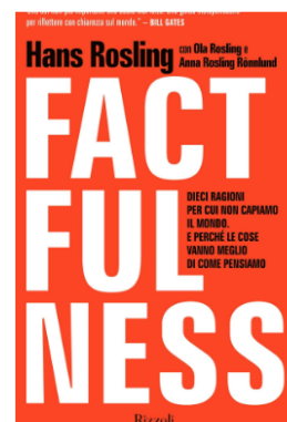
Factfulness (Hans Rosling)