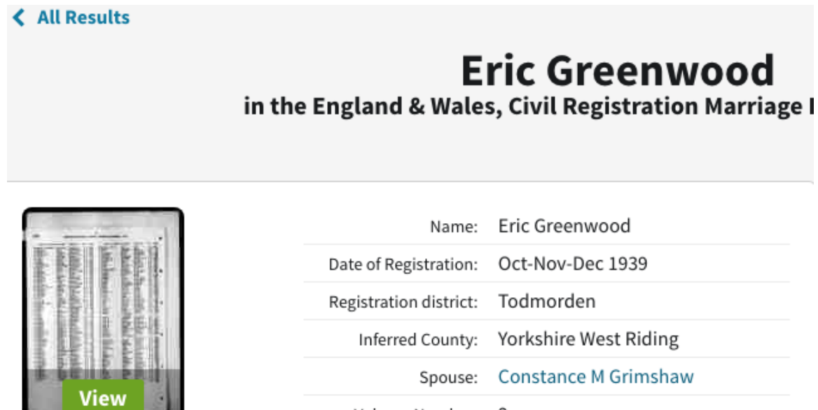
Figure 2 -Screenshot from Ancestry.ca Showing Marriage Record