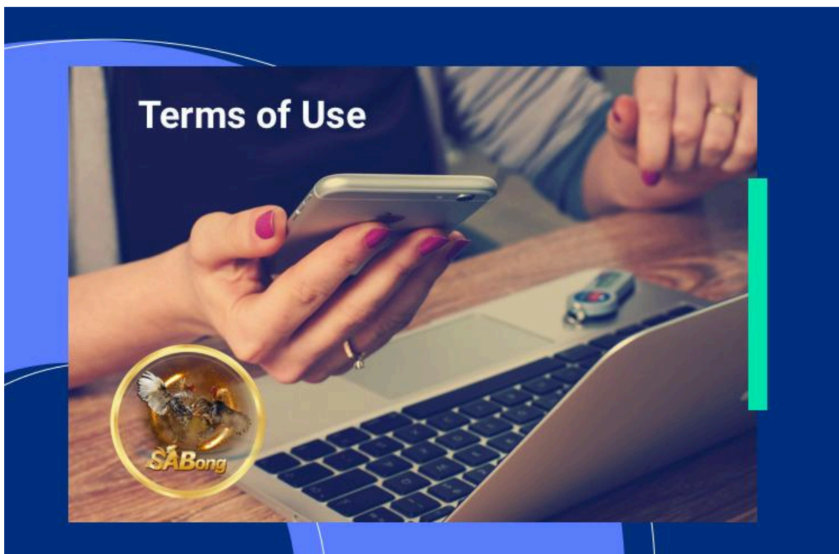
How to Stay Informed About Changes to SABONG Terms of Use