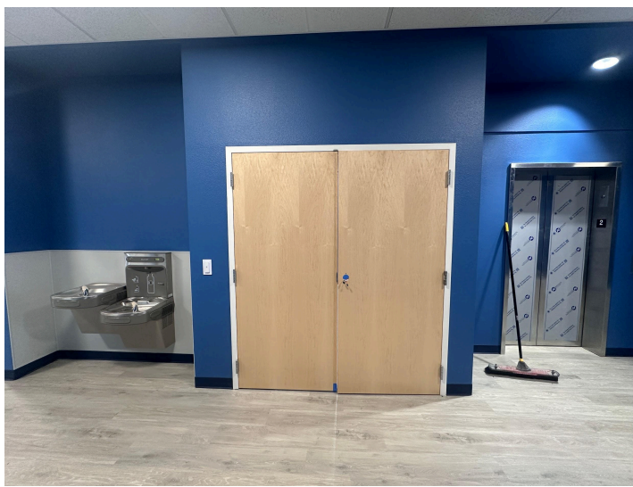
Doors have been installed on Mrs. Olsen's Storage Area...