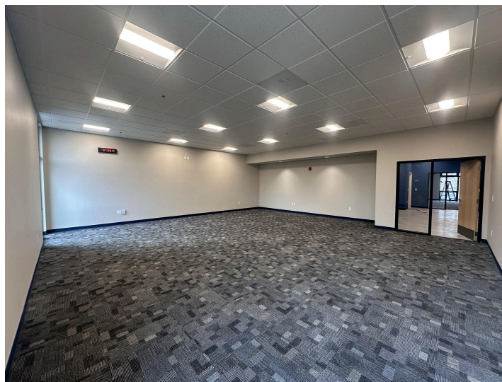
5th Grade Classroom!