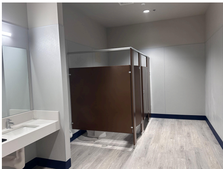
Bathroom Stalls...Looking Grrrrreeeat!