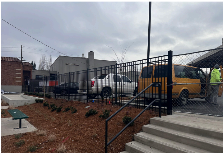
New Fence starting to go around School Grounds