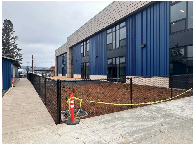
Preschool Playground Fence getting Completed...

9905 SW McKenzie St. Tigard, OR 97223 | school.satigard.org | 503-639-4179