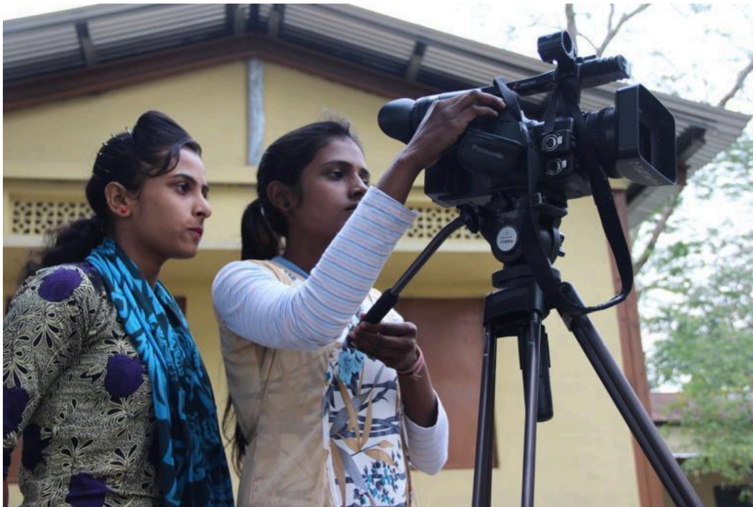
Volunteers experimenting with the camera. Photo dated 28.03.17