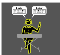
MODEL CHOICE-MAKING WITH MULTIPLE POSSIBILITIES