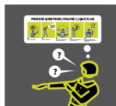
EXPLORE OUTCOMES & PROCESSES