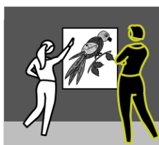
SET THE TASK: SCAFFOLD THE CHOICE PARAMETERS