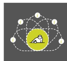
SET UP FEEDBACK LOOPS