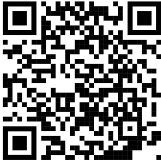
Our FB Group