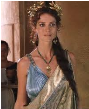
Andromache (Hectors wife):

What did he do wrong? When the fight between Paris (Hector's brother) and Menalaus the king of Sparta took place Hector assassinated Menalaus when he got near him. What is terrible about this is that the fight was between Paris and Menalaus, it didn't concern anybody else at all/justification: Menalaus was about to utterly destroy and massively kill Paris, in which Hectors eye was protecting his younger brother but the act was just wrong, he betrayed the code of the warrior.