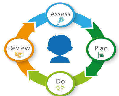
Figure 1. The graduated Approach

The teacher's assessment and experience of the pupil Their previous progress and attainment or behaviour Other teachers' assessments, where relevant The individual's development in comparison to their peers and national data The views and experience of parents The pupil's own views Advice from external support services, if relevant The assessment will be reviewed regularly.