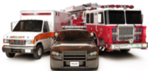
Vehicles to public service

Review the policies and protocols for your district and remind our students if they See Something, Say Something!