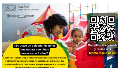
Spanish Flyer Template