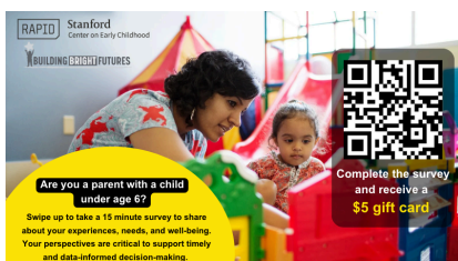
English Flyer Template