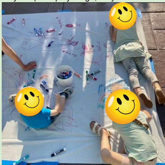
<-- Giant "Dry Erase" (shower curtain and markers)

Sensory Play Dramatic Play Drop-in stop motion animation Print-making Explore the art of...[insert artist] Family Collaborative Art Program (families will rotate through adding to each piece) CD Weaving (see picture) Perler Beads Clay Art (offer playdough, crayola model magic, air dry, etc.)