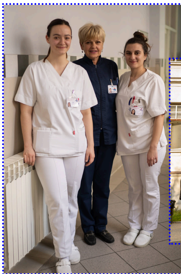
Visiting hospital Sveti duh (Croatian mentor and students) and project partners