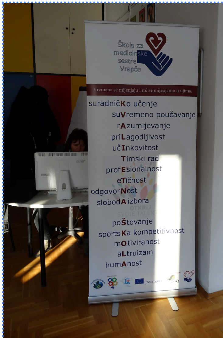
Advent in Zagreb

From the project and from Vrapče school.