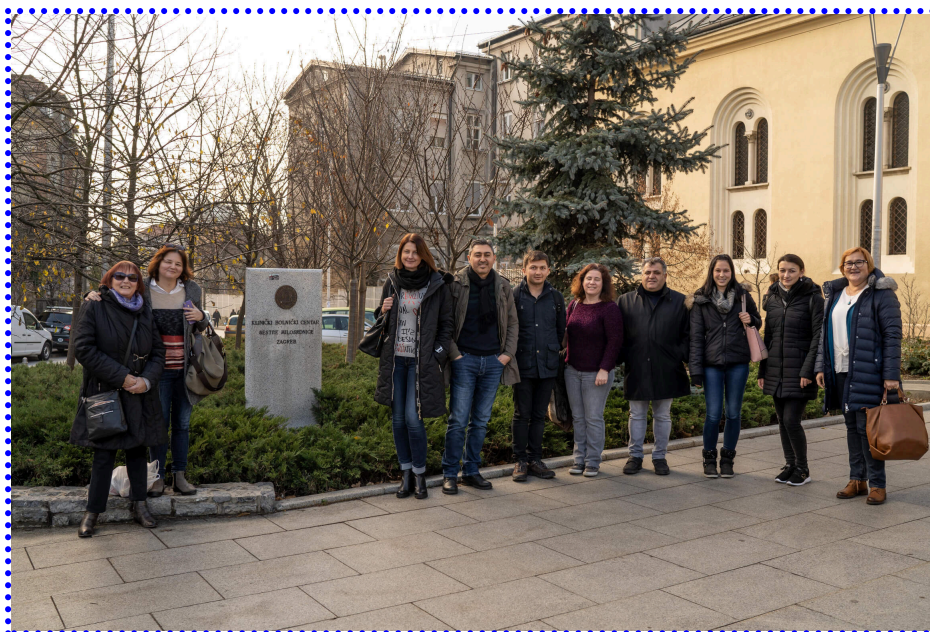
Clinical center Sisters of mercy, Zagreb