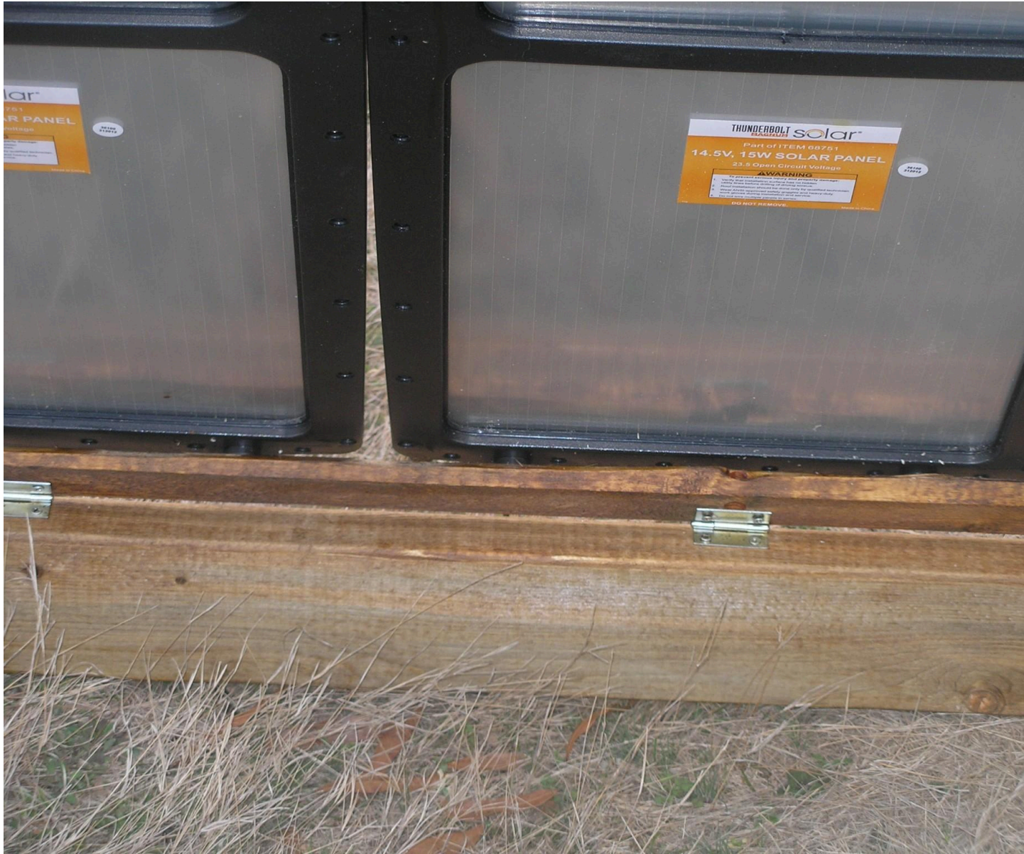
Hinges mounted to treated 1x2 & to the treated 2x4 base.