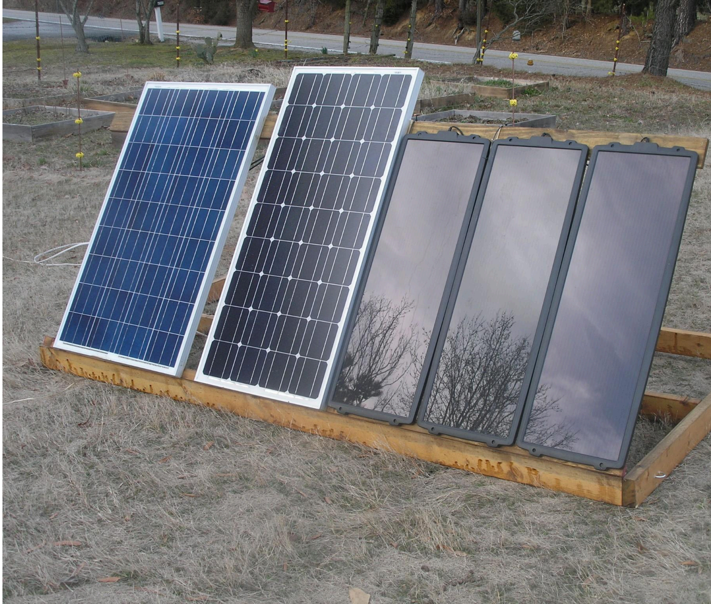
Left solar panels are 100 watts each from SolarBlvd right panels are 15 watts each from Harbor Freight. Round fence posts to be attached to the shackle bolt seen on the right.