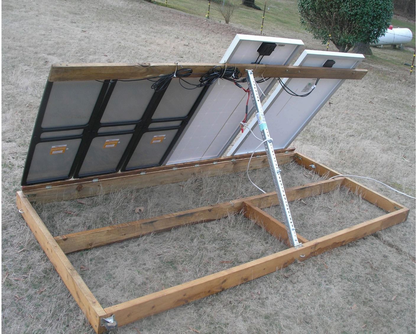
Easy adjustment for panel tilt with wing nuts & metal bars attached to hinges. Wheel in corner makes it easy to move - Note many hinges under the panels for tilting toward the sun. Panels are mounted between a treated 1x4 (top) and a treated 1x2 (bottom). Frame is treated 2x4's.