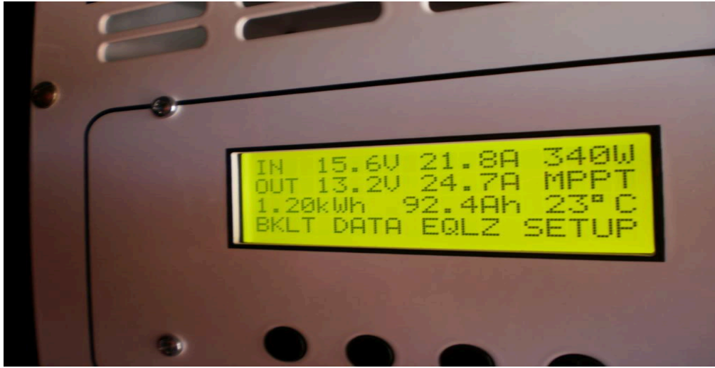
Photo: 12 Volt Panels, 21 A in, 24 A out using Rogue MPPT Controller , Video , Manual