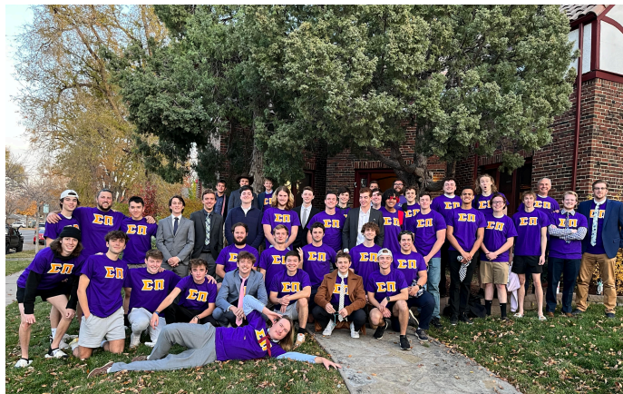
Sigma Pi brothers in front of the fraternity house.

We partner with the university each semester to help local elderly residents in the community, raise money for St. Jude Children's Hospital, clean up natural areas, and host regular fundraising events for Realities for Children. We also participate with other greek organizations at their philanthropic events.