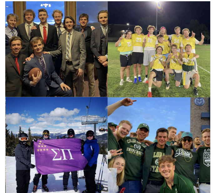
Brothers enjoying events/trips together

The bonds of brotherhood are forged in many ways. We try to strike the right balance between academics and fun. The fraternity uses its resources to support different opportunities to socialize. Examples include weekend parties, trips (Spring Break at Winter Park, Lake Havasu, and South Padre Island), alumni gatherings, and formal events such as the Orchid Ball. We also play intramural sports such as soccer, flag football, and basketball. We also meet up to attend CSU sports functions and other local events.