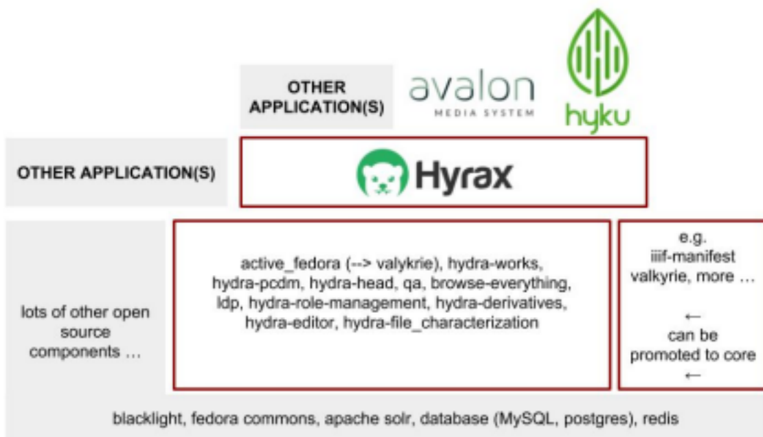
Figure two: the anatomy of a Samvera application, exploded