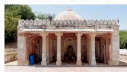
Mosque-Bhodesar Mosque, Tharparkar