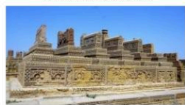
Graveyard-Baloch Graveyard Karachi