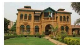
Heritage Building-Quaid-e-Azam House