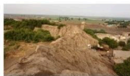
Fort-Sehwan Fort, Jamshoro