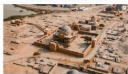
Graveyard-Makli Hill, Thatta