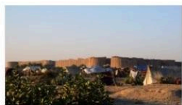
Fort-Naukot Fort, Tharparkar

Creative Commons open sharing by using CC licenses and advancing the universal access and fostering creativity, innovation, & collaboration in higher education (2022-2023).