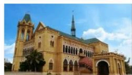
Heritage Building-Farrer Hall