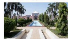
Mosque-Shah Jahan Mosque Thatta