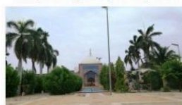
Mosque-Jami Mosque, Thatta town