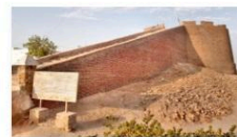
Fort-Umerkot Fort, Umerkot