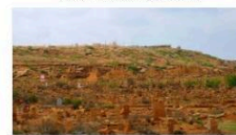
Graveyard-Soonda Graveyard, Thatta