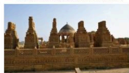
Tomb-Chaukandi Tombs, Karachi