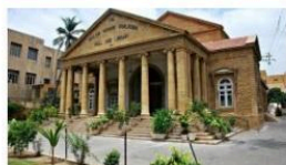
Heritage Building-Khaliqu Dina Hall, Karachi