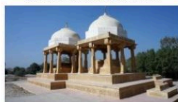
Tomb-Hala Monuments (Mirs Tombs), Matiari