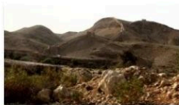
Fort-Rani Kot Fort Jamshoro