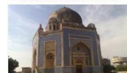
Tomb-Mian Ghulam Kalhoro Tomb, Hyderabad