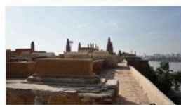
Graveyard-Satyan jo Than Rohri, Sukkur