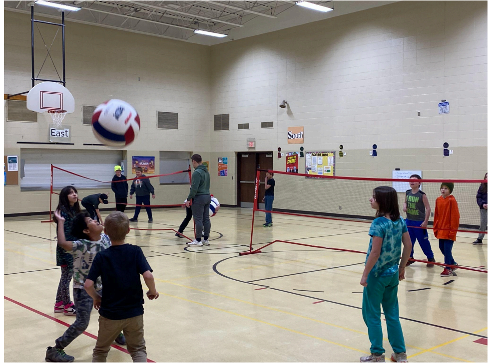
Playing volleyball games in Phy. Ed.