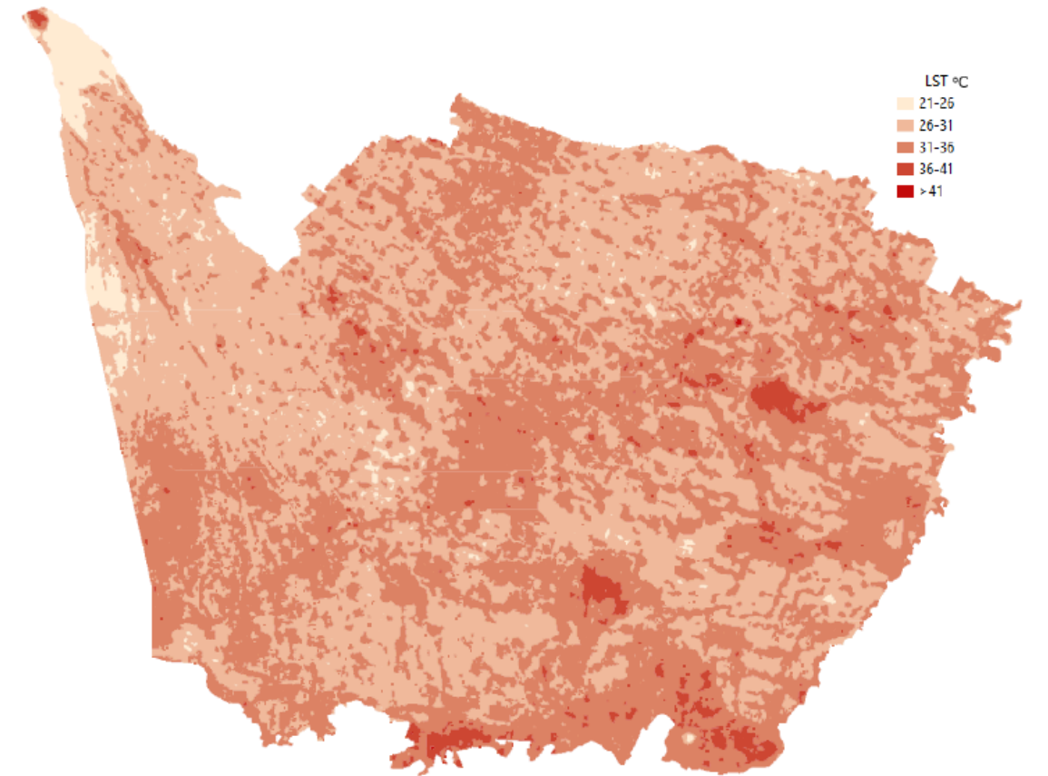
Figure 2. Images can be displayed in a single column to show more detail.

Figure 1. Captions for figures should appear below the figure. References that use figures, tables, theorems, or lemmas should begin with a capital