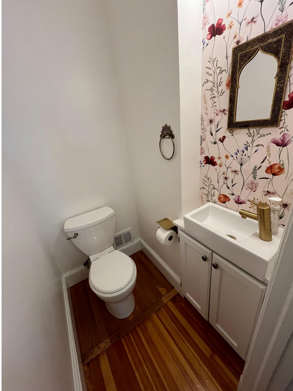
Powder room off of the kitchen (current)