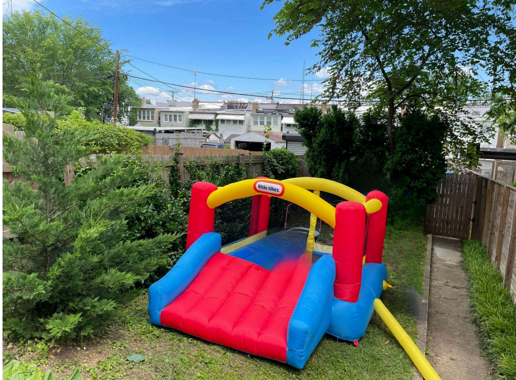
Back yard in summer with a bounce house (available for your use if you would like!)