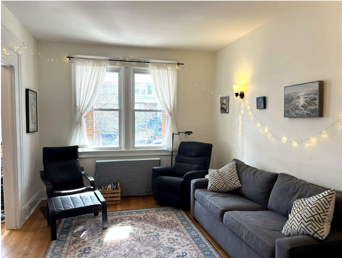
Living Room (current)

google doc. We can also provide video tours.