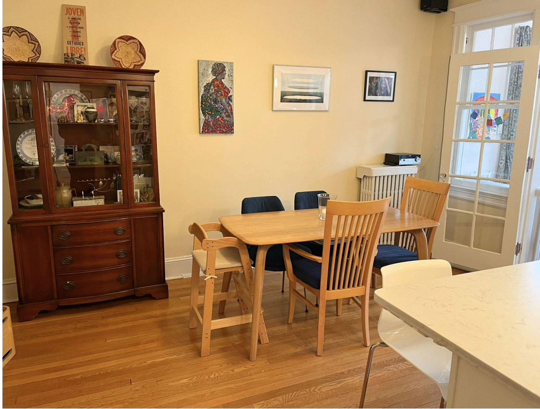
Dining area (current)