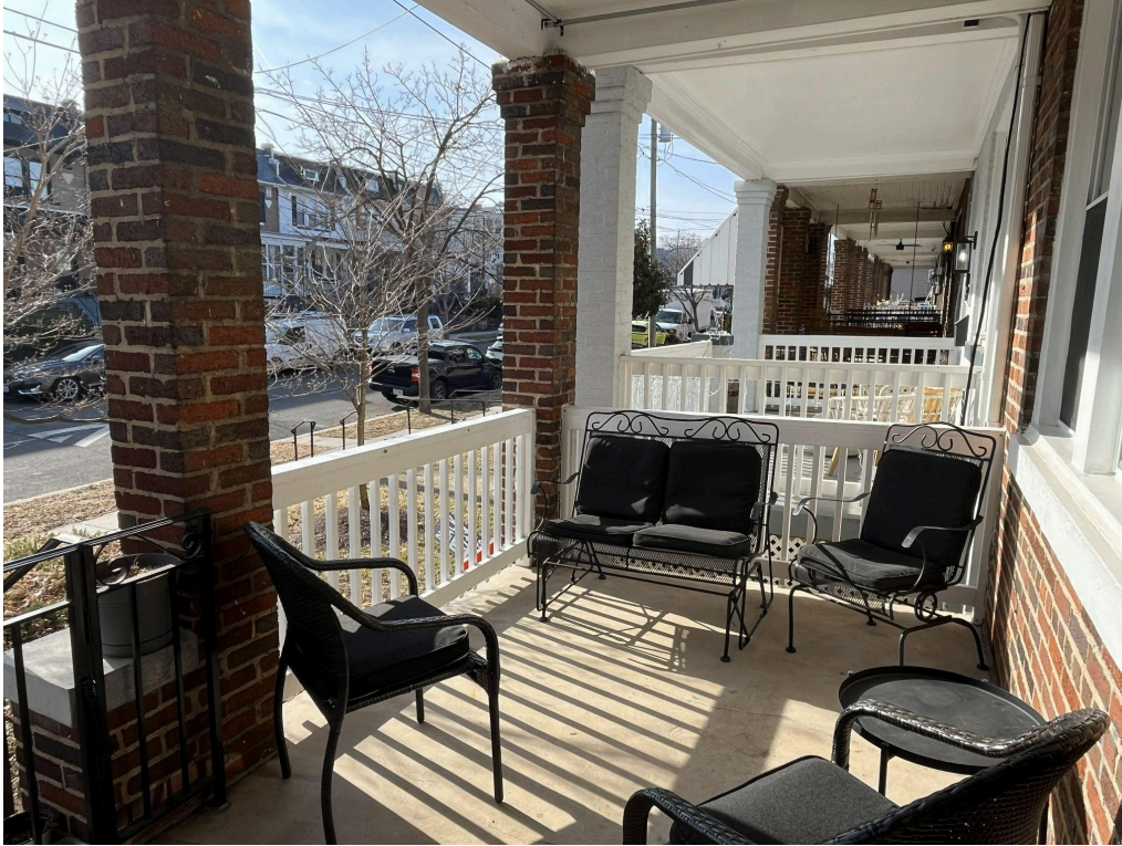
Front Porch (current)