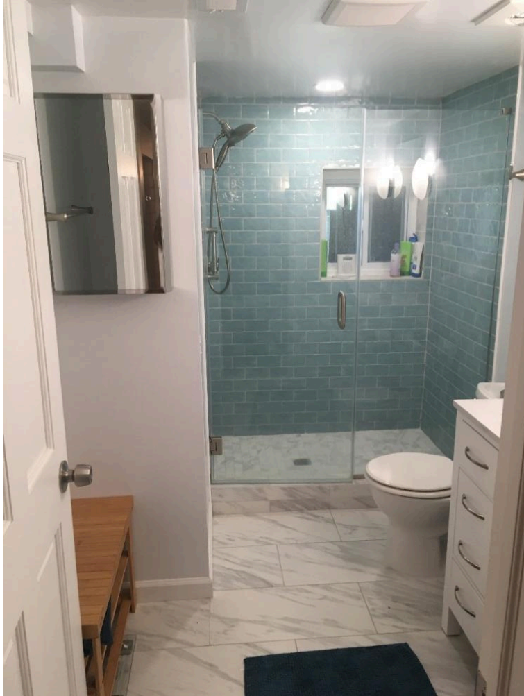
En-suite bathroom adjoining basement bedroom (current).