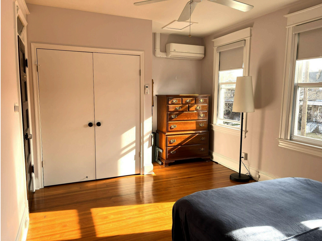
Master bedroom (3 of 3).