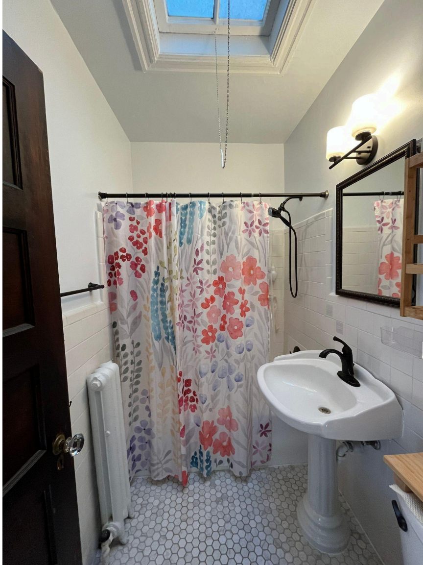
Upstairs bathroom with antique skylight (current)