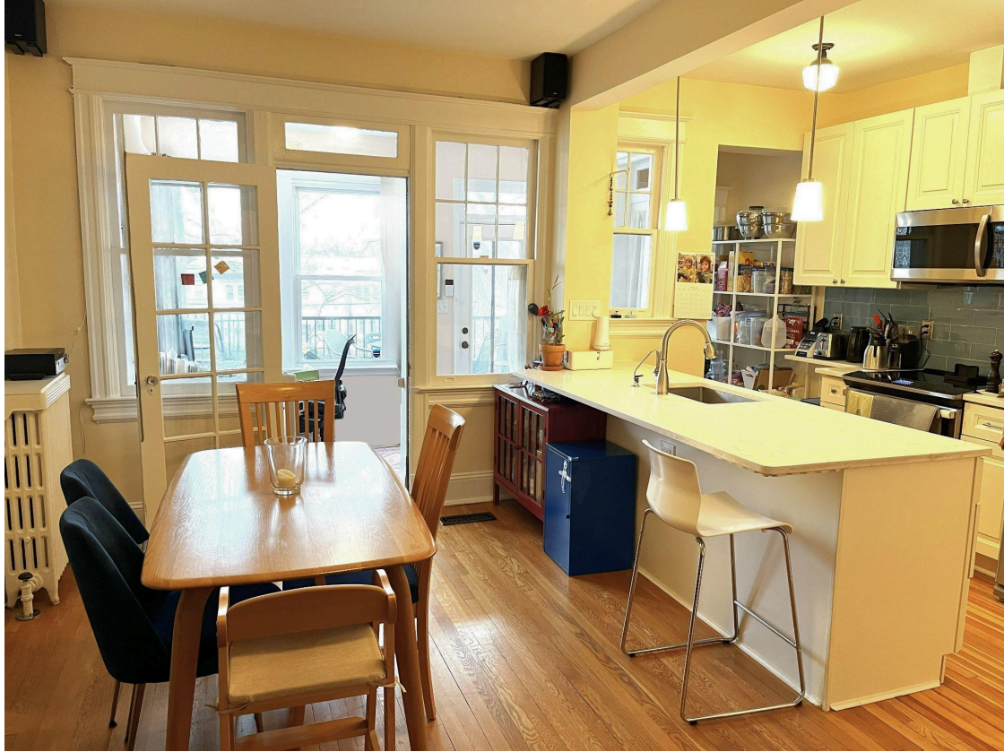
Dining area and kitchen with view of downstairs office (current)