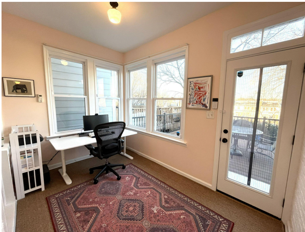
Downstairs office/bonus room (current) (1 of 2). Note this rug fits the floor but is sitting on top of heart pine hardwood and can be removed.