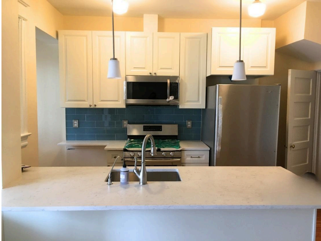
Renovated kitchen (2021). Gas range has been replaced with induction range. The door on the right leads to the basement and is next to the door to the powder room.