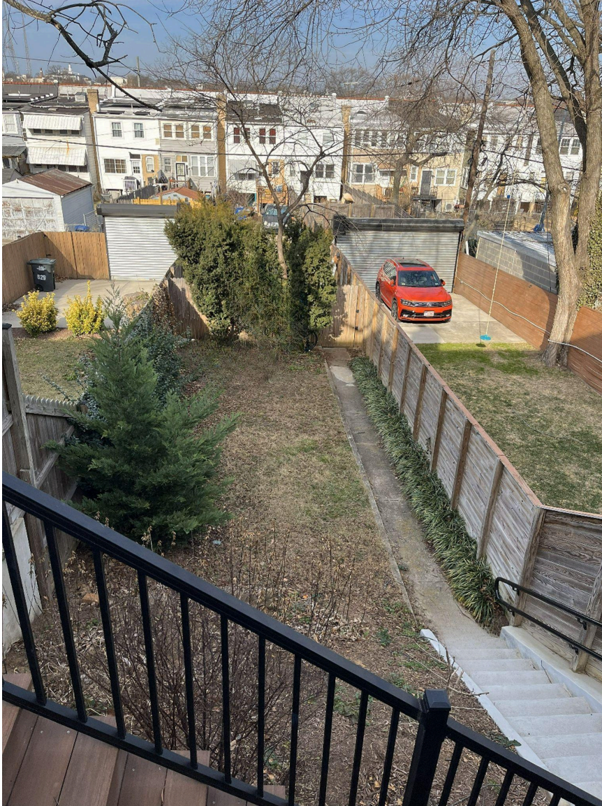
Back Yard view from the deck in winter (current). The parking pad is behind the fence and evergreen trees. A locked gate separates the yard from parking and the alley.