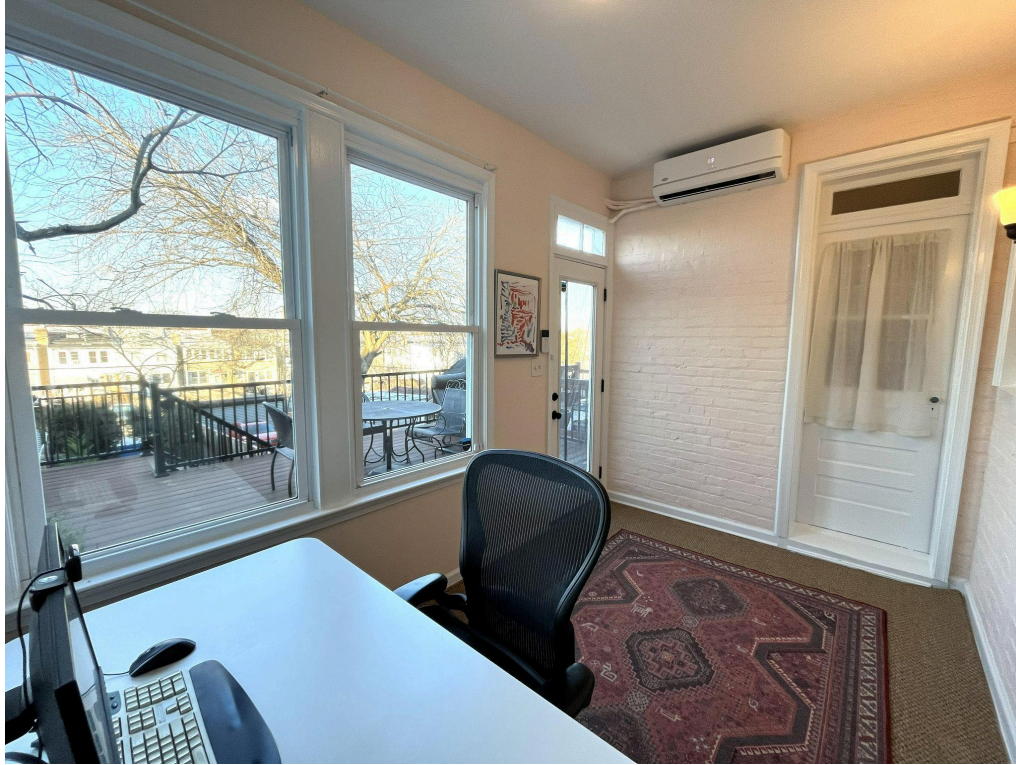
Downstairs office (2 of 2)