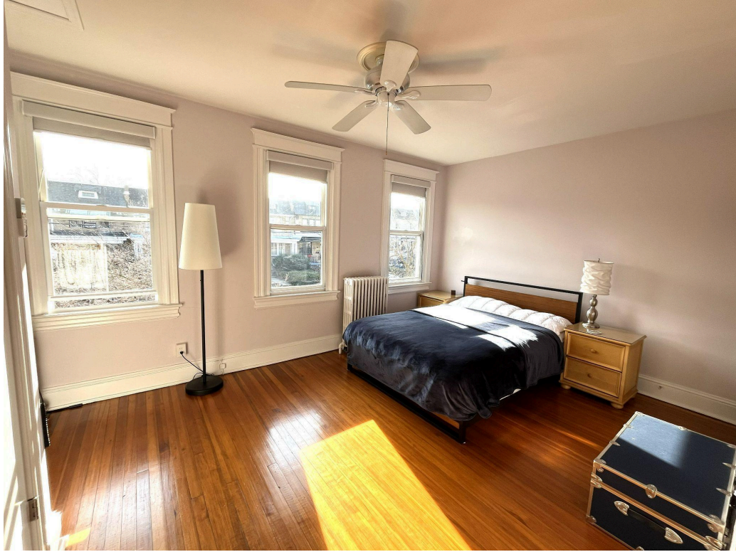
Master bedroom (current), with queen bed, two closets, and floor space for yoga (1 of 3).