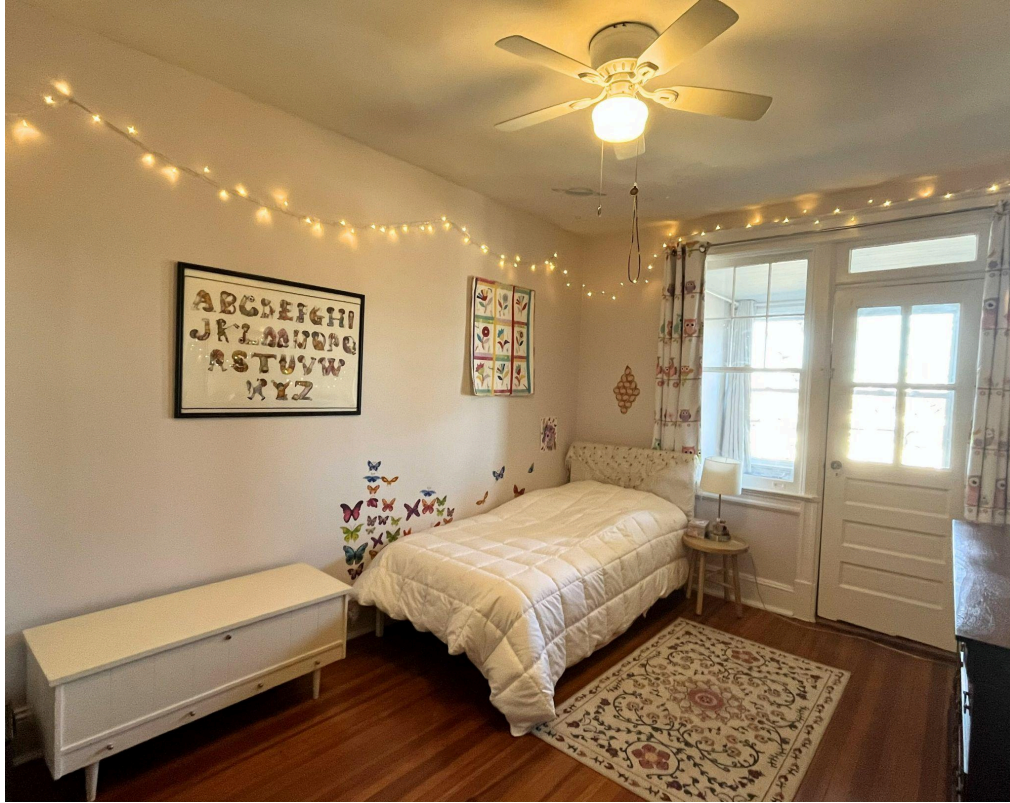
Second bedroom (current) with twin bed, 6-drawer dresser, chest, closet, and play kitchen (not visible).