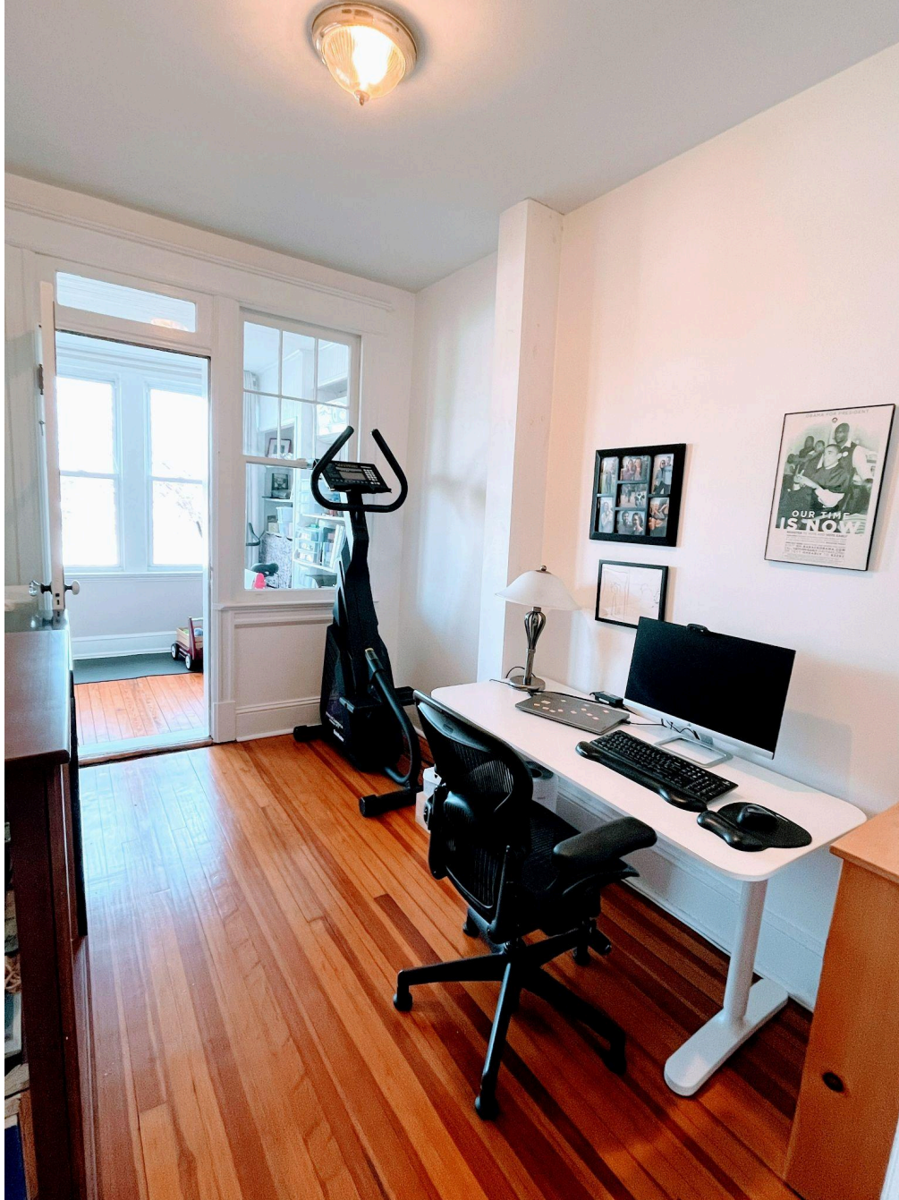
Office (current) with partial view into playroom/bonus room. This could also be a nursery.