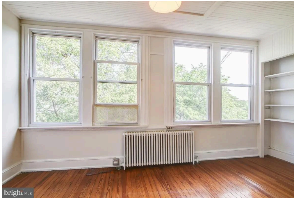
Upstairs playroom/office/bonus room (2020), 2 of 3. Updated with a mini-split instead of radiator, and newly painted. Currently used as a child playroom and also has a stationary spin bike.