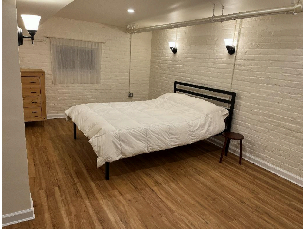
Basement bedroom (current). Comfortable queen bed.