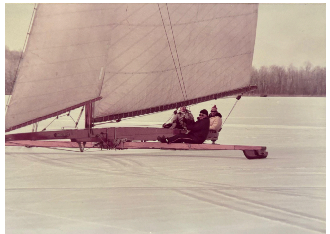
Orange Lake Jan 1984