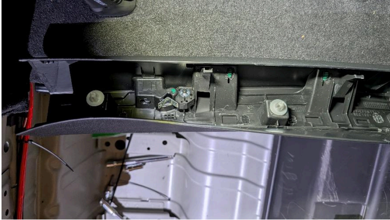
- Close up of the trim tabs.