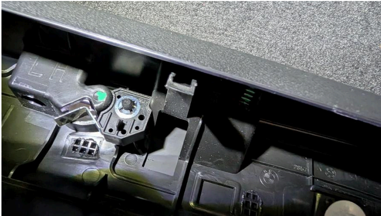
- The slots on the tailgate where the trim tabs and clips insert.