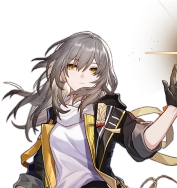
Stelle -The Trailblazer