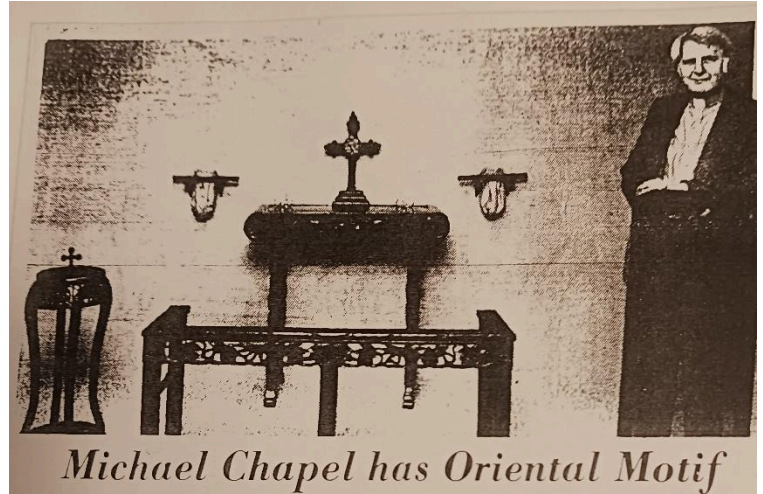
Michael Chapel has Oriental Motif