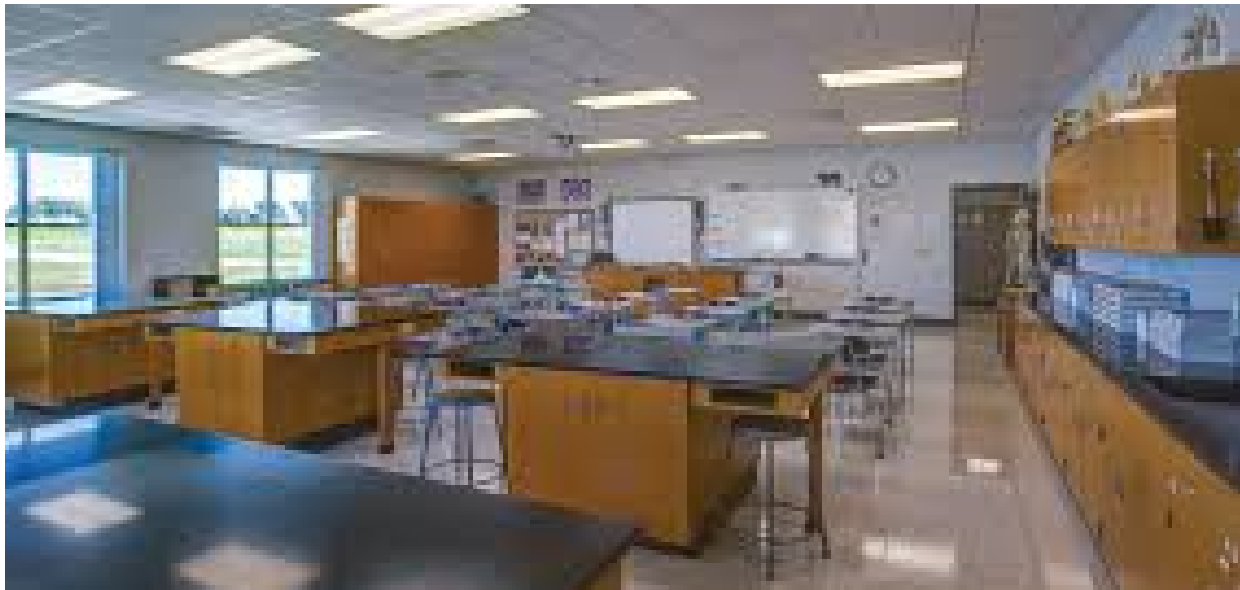
Image Description: Photo of one of the rooms that will be used as a challenge presentation site. The classroom has large lights built into the ceiling tiles, white walls with a clock, whiteboard, smartboard and some windows, and brown tables and cabinets with a dark counter top. This is a science classroom so there's lots of room for students to work and stools for students to sit at. This room will be modified to accommodate the challenge presentation requirements.