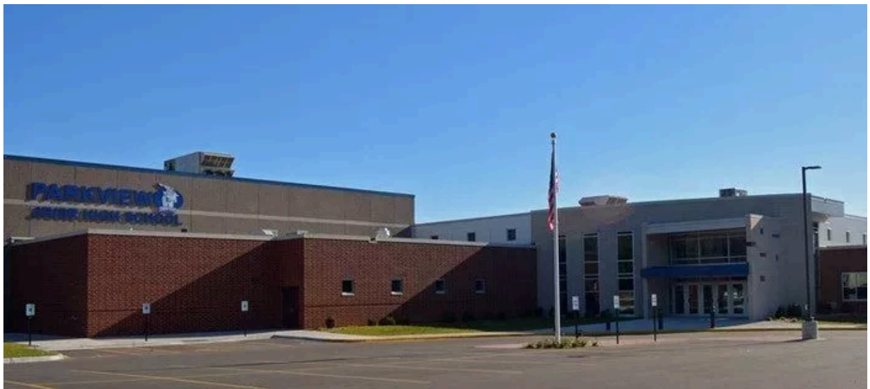
Image Description: Photo of Parkview's Exterior with the main entrance and accessible parking in view. The building is brown and white in color. There is a flag pole and a parking lot in front of the building.