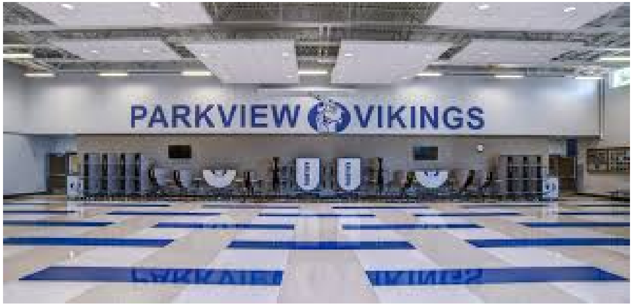
Image Description: Photo of the Main Commons area which is where food and the merch table will be located. In the photo the tables are folded up and placed against the wall, during the tournament the tables will be out for people to use. The tile floor has large tiles of white, cream and blue in a pattern of rectangles and squares. The walls are mostly white and the top half of the main wall has "Parkview Vikings" and the school logo (a Viking with a sword) in blue.