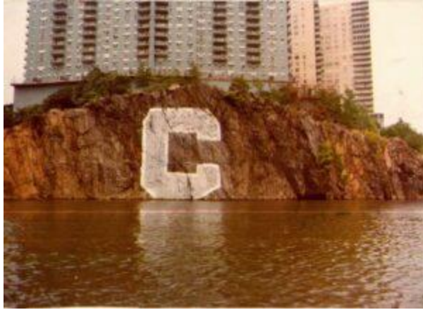
The Cut as seen from Inwood Hill Park - Jim