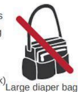
Large diaper bag

An exception will be made for medically necessary items after inspection at the entrance