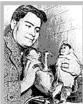
A young Jimmy Jones bones up on mind-control techniques

Gov. Jerry Brown and Willie Brown , who would become the Assembly Speaker and a mayor of San Francisco , appeared at an honorary dinner for pedophile Jim Jones .