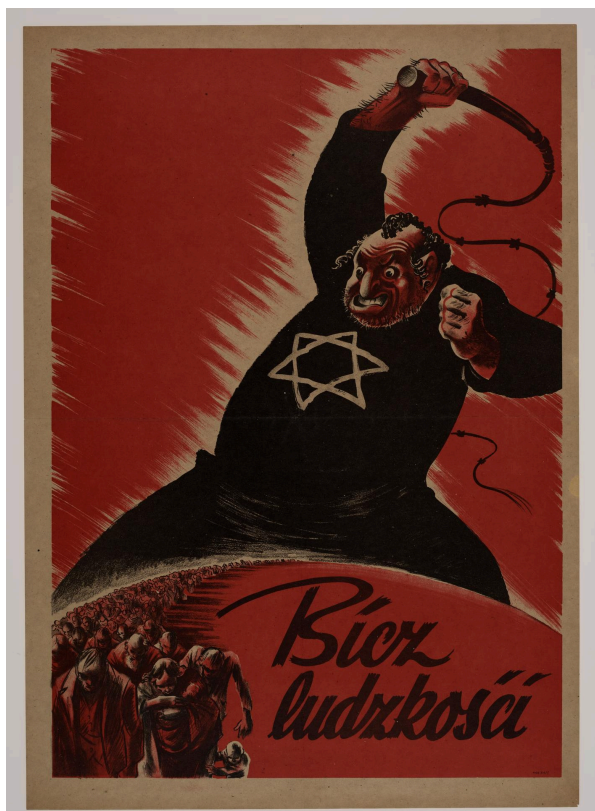
'The whip of humanity', antisemitic poster from the Nazi-collaborationist Polish government, 1940s