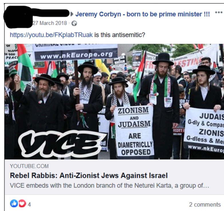
Facebook post with an image of members of Neturei Karta, 2018