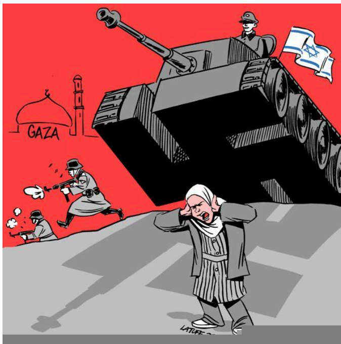
Latuff cartoon comparing Israel to Nazi Germany, 2009