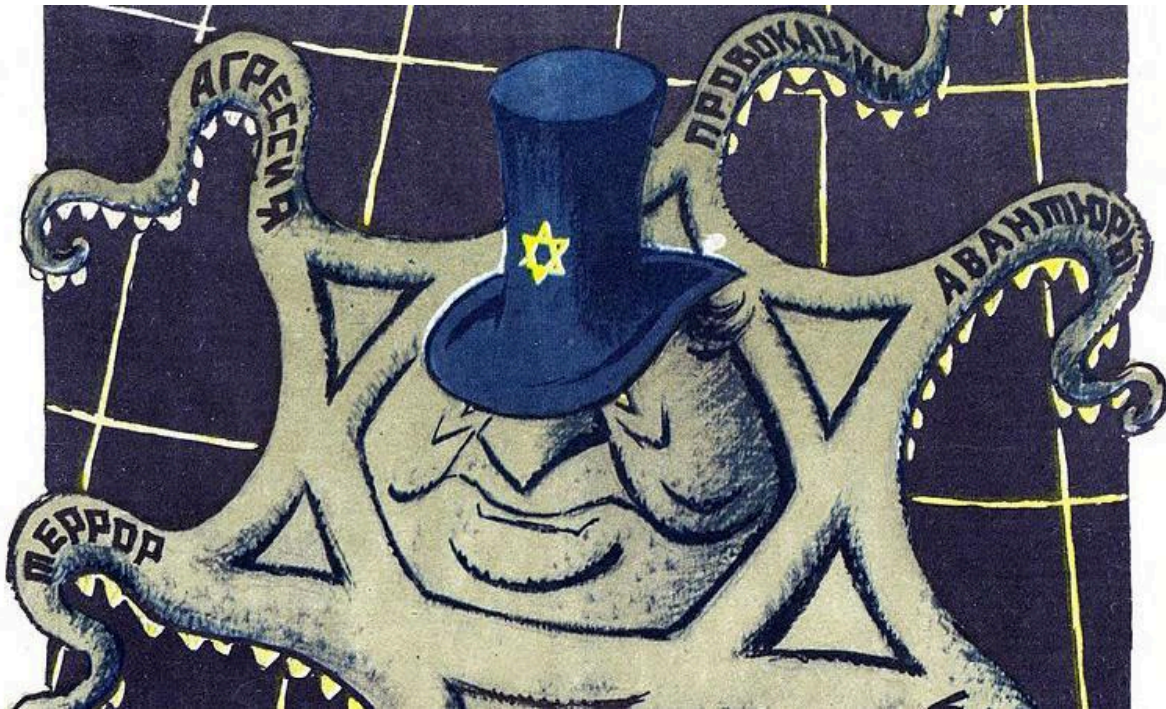
Antisemitic cartoon from a Soviet magazine, 1972