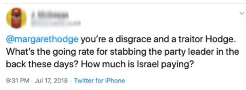
Tweet to Margaret Hodge MP, 2018