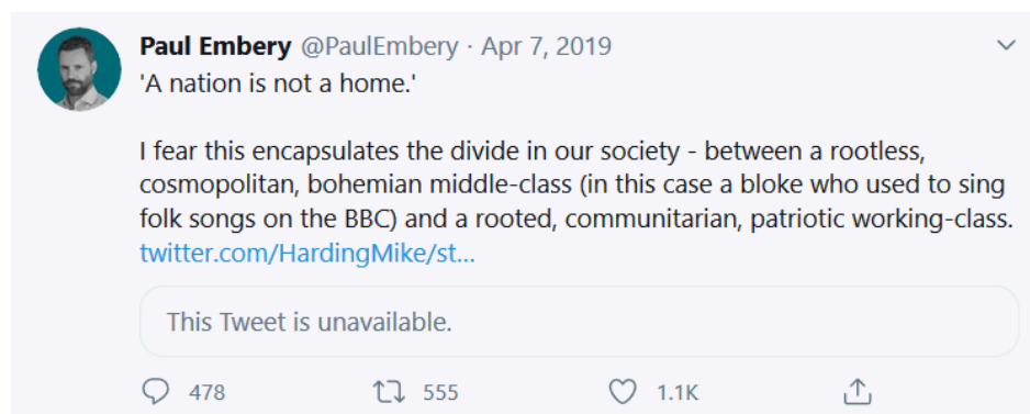
Tweet by Paul Embery, 2019