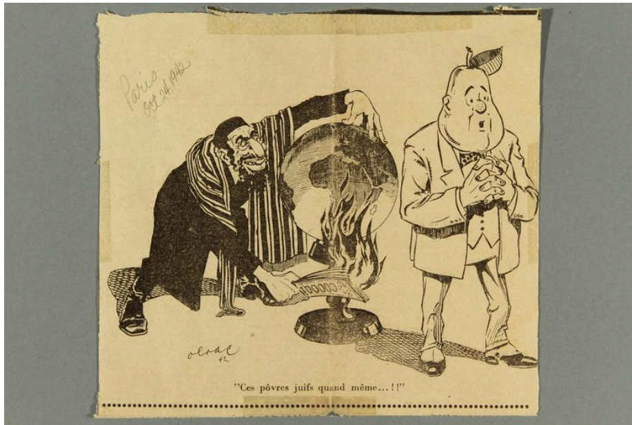
French antisemitic cartoon, 19th century

Others (considered but not used in the session):