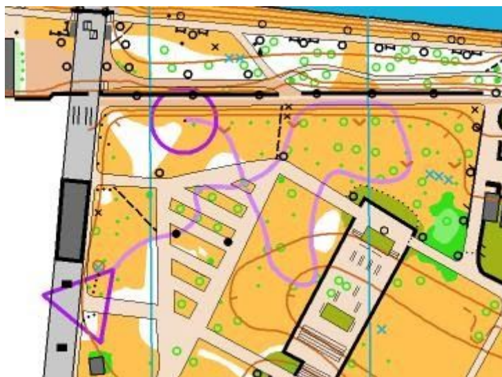
Cemetery - back side of the map (example)

This year, the “Cemetery of Controls” will be special: