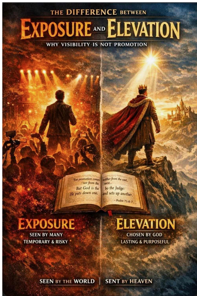
Exposure and Elevation