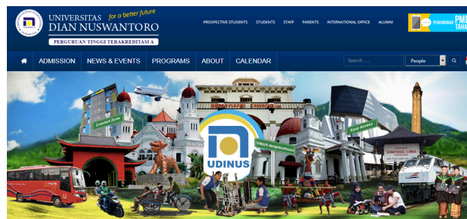
Figure 1 Figure Caption [Source]. Use Figure Style for automatic figure numbering

DO NOT copy and paste a screen captured image in this file. If you have a screen captured image, use a separate image editor to edit and resize the picture and then insert the images by using Insert > Pictures menu. Photographic images should have a minimum resolution of 200 dots per inch (dpi) at the final print size.