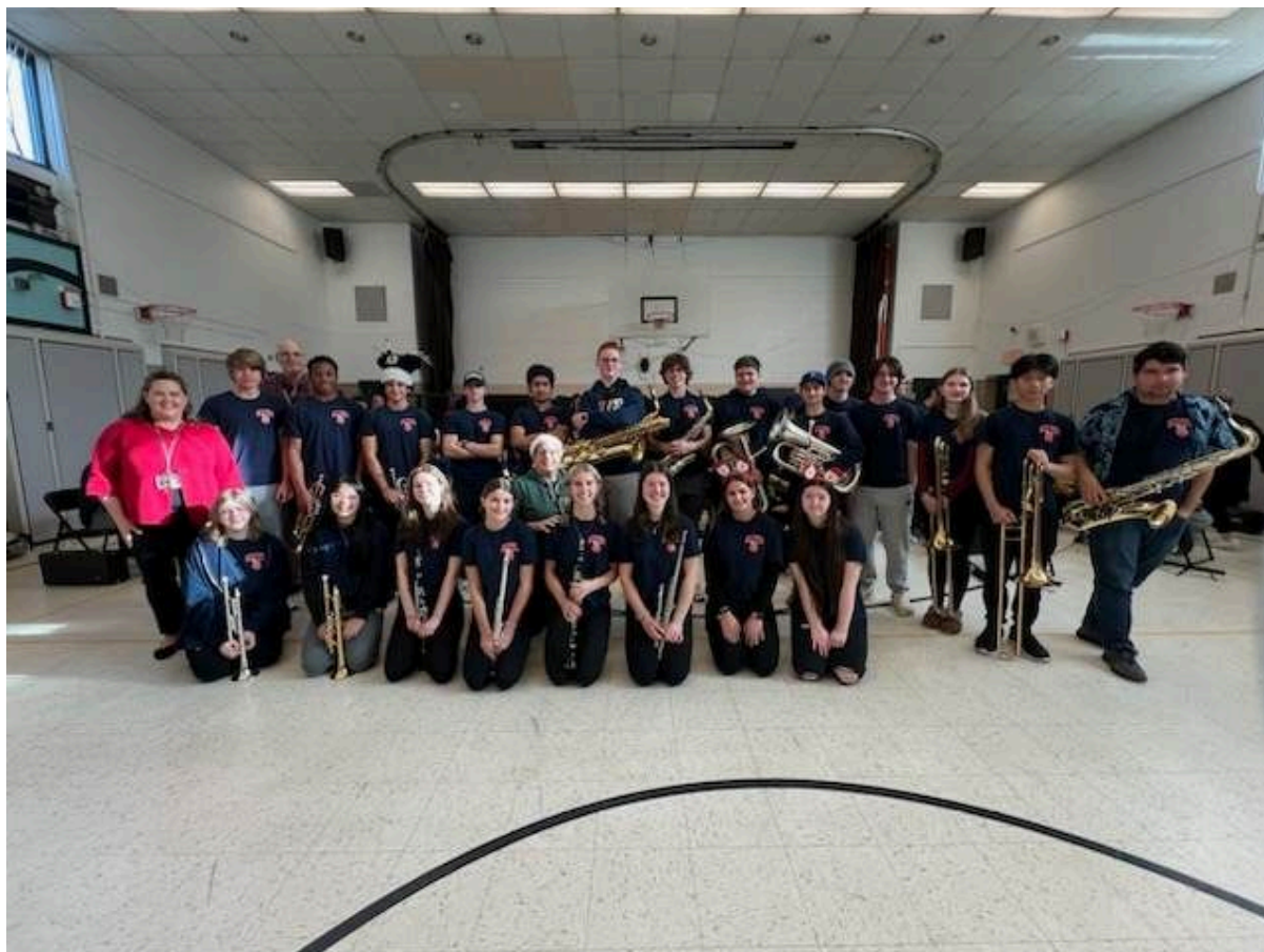
All former Live Oakians - now in the Foran High School Band!