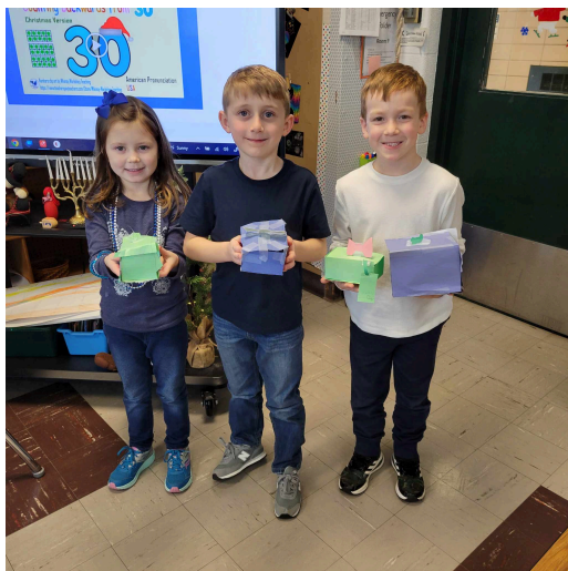
Fourth Grade students shared their holiday traditions.