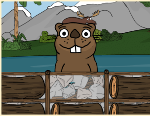
Code Monkey *