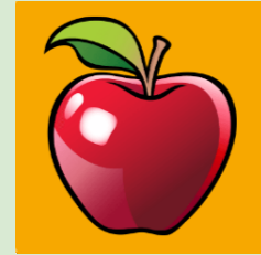
Drag and Drop