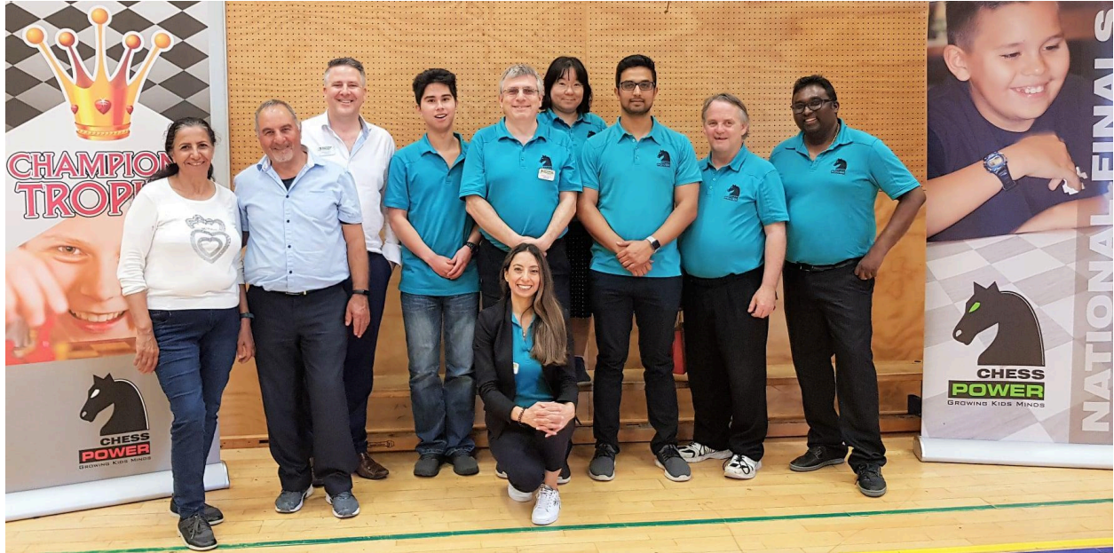
The Chess Power team

I personally wish you and your team the very best of success at the Champions Trophy OPEN 2021. I am confident you will be challenged at the highest level and will thoroughly enjoy a rewarding life experience.